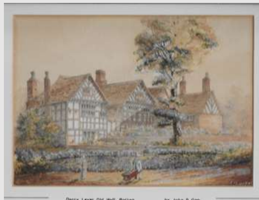
Darcy Lever Old Hall, Bolton

The Monthly Newsletter of the Bolton Family History Society: